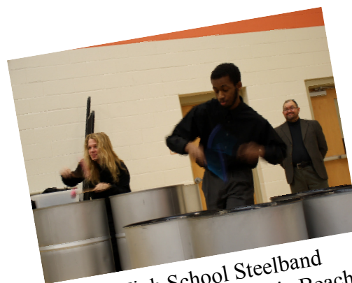
Salem High School Steelband performing at the Virginia Beach City Schools' African American Male Summit, January 8

Salem High School's Rhythm Project ensemble had a busy start to the year with performances at host school's open house (1/7) and at the Virginia Beach African American Male Summit at Renaissance Academy (1/8). This talented group was also featured during a pre-show performance for Savion Glover: SoLo in Time at the Sandler Center for the Performing Arts (2/17).