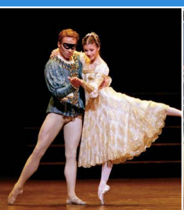
Romeo and Juliet April 20, 2018