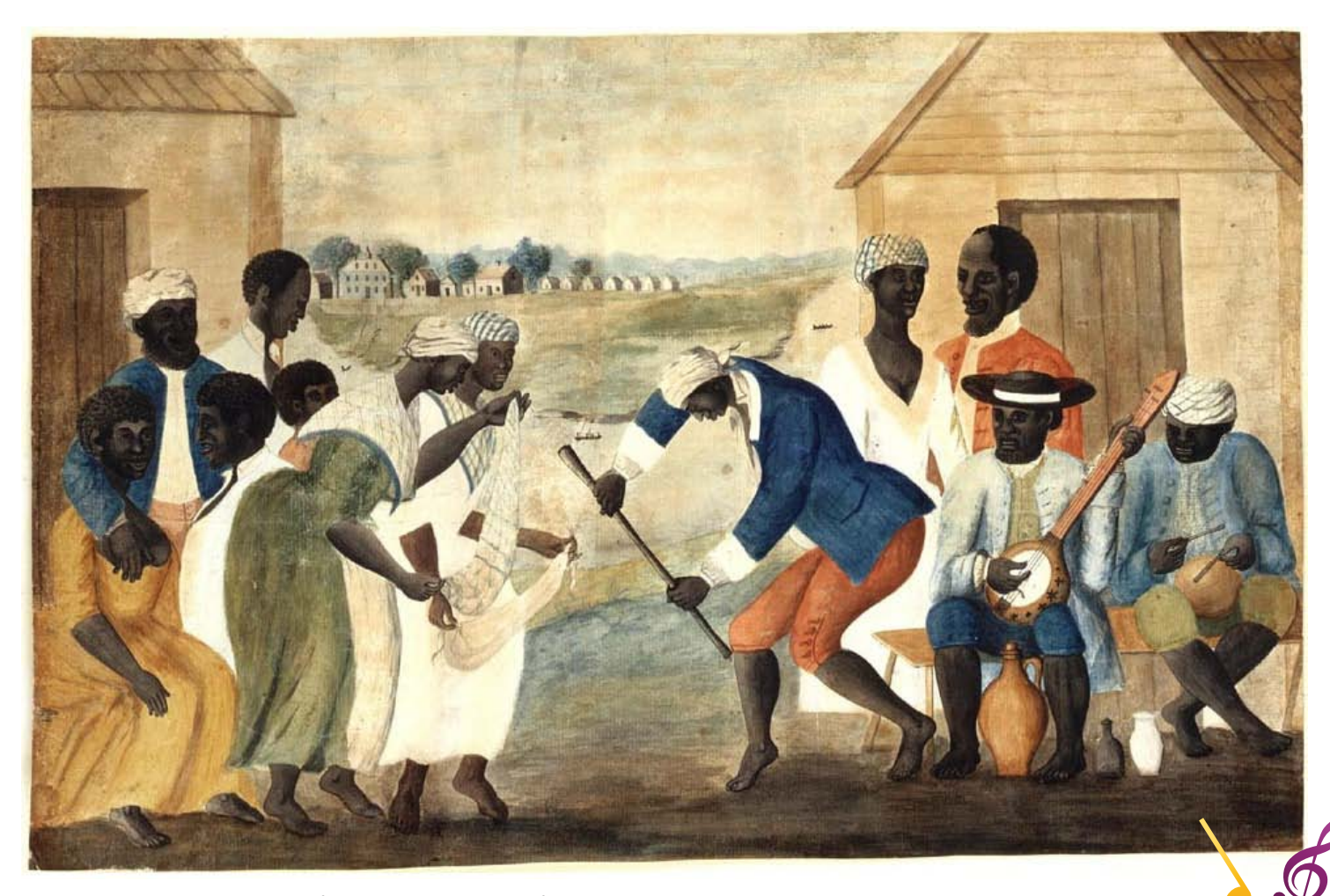
The Old Plantation (anonymous folk painting). Depicts African-American slaves dancing to banjo and percussion

Plantation dances moved to the stage with the minstrel shows of the 1800s, which included skits, music, and dancing performed by black men