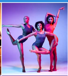
Alvin Ailey® American Dance Theater March 2, 2018