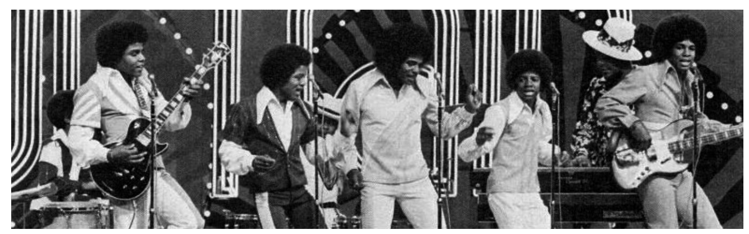
The Jackson 5 performing on the television program Soul Train

and white men in "blackface." Using burnt cork, greasepaint, or shoe polish, the white performers would blacken their faces. The performers would sing, dance, or act in ways that borrowed from or made fun of the culture of slaves and other people of African descent.