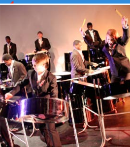
Rhythm Live! February 23, 2018