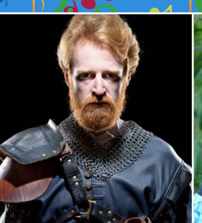
Macbeth January 17, 2018