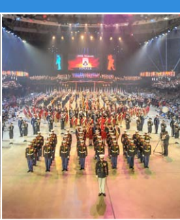
Virginia International Tattoo April 25-27, 2018