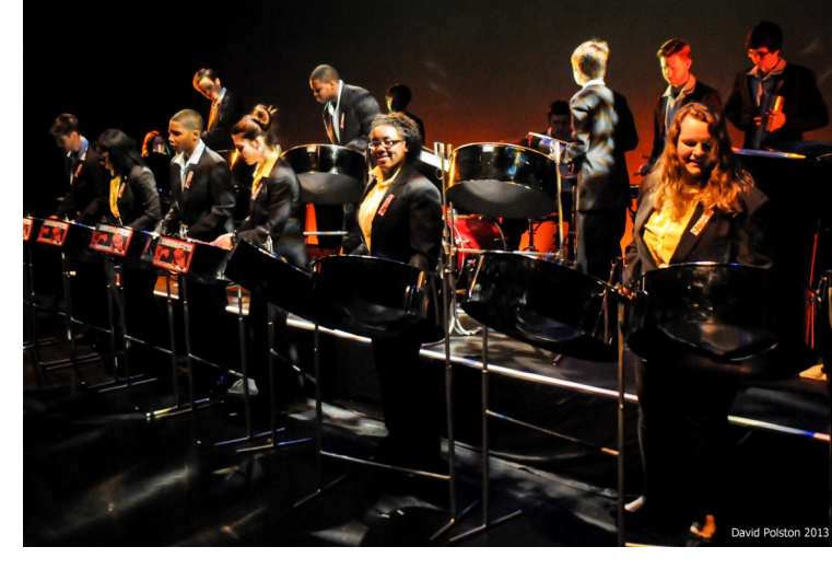
11th Annual PANoram bur Rhythm Project ensembles performed at the Virg