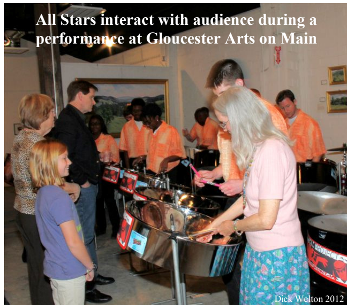
All Stars interact with audience during a performance at Gloucester Arts on Main