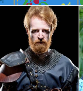
Macbeth January 17, 2018