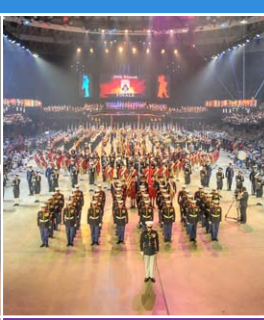
Virginia International Tattoo April 25-27, 2018