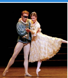
Romeo and Juliet April 20, 2018