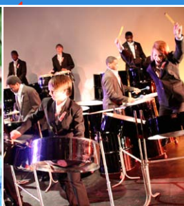
Rhythm Live! February 23, 2018