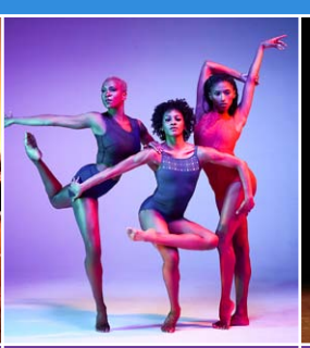
Alvin Ailey® American Dance Theater March 2, 2018