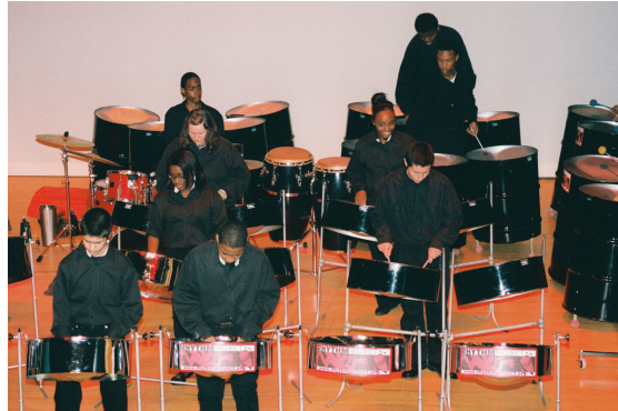
The Junior All Stars perform at the 9th Annual Rhythm Project Showcase Concert (11/19/10). The All Stars and Salem High School were also featured at this event.