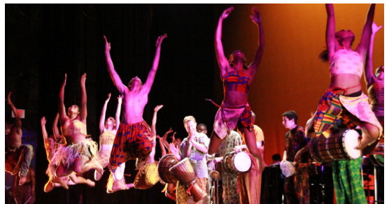
The Governor's School for the Arts (GSA) African Drumming Ensemble and GSA Dance Department perform in a collaborative production with the All Stars for Rhythm Live! (2/11-2/12/11, Norfolk and 3/24/11, Newport News).