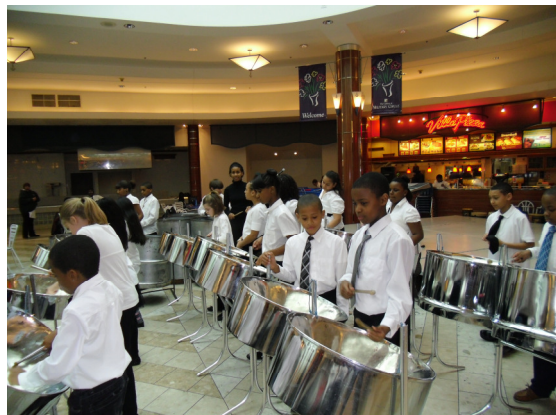
The Norfolk Rising Stars at Fairlawn Elementary School perform at Military Circle Mall (3/30/2011). This 4th/5th grade group performed at 3 additional events this year including the Downtown Norfolk Council Annual Luncheon.

The All Stars perform at their new home, the Virginia Arts Festival, Robin Hixon Theater (12/2/10). In addition to housing the All Stars, the theater now serves as a rehearsal space for two additional Rhythm Project ensembles: the Junior All Stars and Hampton Roads Rising Stars.