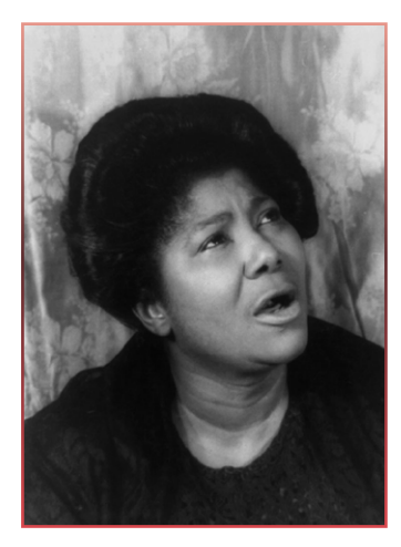
Mahalia Jackson, 1962, from the Carl Van Vechten photograph collection, Library of Congress.

As African Americans established their own churches in the nineteenth century, their religious music continued to evolve into a rhythmic and highly emotional style that usually involved the entire congregation—singing, clapping, and moving with the music. In the twentieth century, instruments such as tambourines and electric guitars were added to the sound, and gospel music spread as African Americans moved from the rural South to cities across the nation.