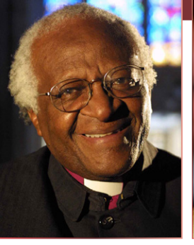
Archbishop Desmond Tutu. Nelson Mandela.

upgrade the infrastructure and beautify Soweto by creating parks and planting trees.