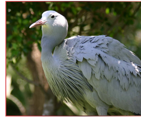
Photos L-R: Baboons. Camps Bay. Wild dog. Blue Crans.

Colonialism is when one country takes full or partial political control over another country, occupying it with settlers and exploiting it economically. What groups of people have settled in South Africa? How and why? With colonialism in mind, how is South Africa's history similar to and different from the United States of America? What challenges facing South Africa today might be a legacy of colonialism and apartheid? Could South Africa's nickname of "Rainbow Nation" also apply to our country? Why or why not? Research online or in the library if you need more information, then write down your thoughts or discuss or present them in class.