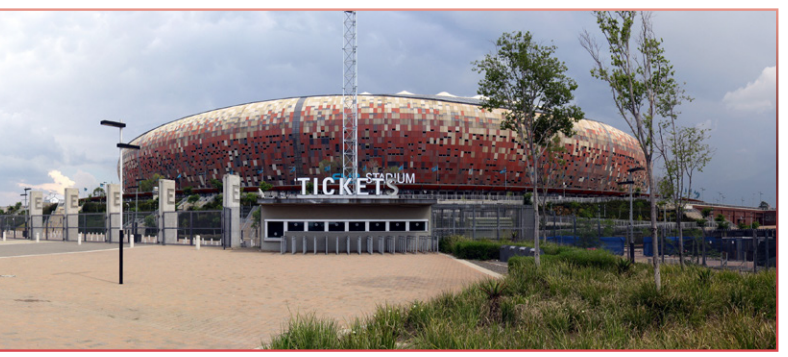
FNB Stadium by Prosthetic Head.

The name Soweto is an acronym for <u>So</u>uth <u>We</u>stern <u>To</u>wnship, established in the early days of Johannesburg to house workers for the mining industry. Labor was drawn from many countries of Southern Africa, and this was the origin of the broad diversity of cultures in South Africa. During the time of apartheid, "townships" were established by whites. These were segregated public housing areas for nonwhites, usually built on the outskirts of cities.