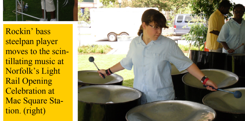
Rockin' bass steelpan player moves to the scintillating music at Norfolk's Light Rail Opening Celebration at Mac Square Station. (right)