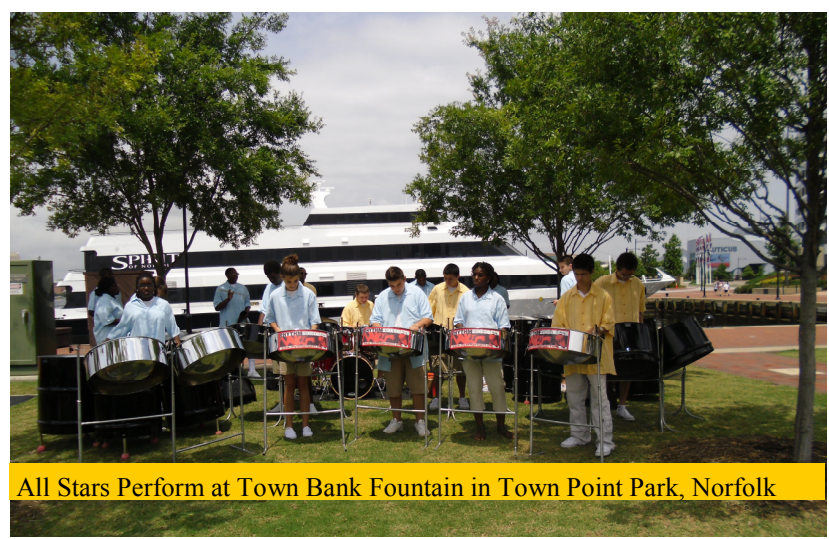
All Stars Perform at Town Bank Fountain in Town Point Park, Norfolk