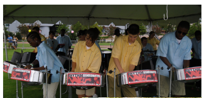
A well synchronized frontline wows the crowd at Virginia Carib Fest. (left)