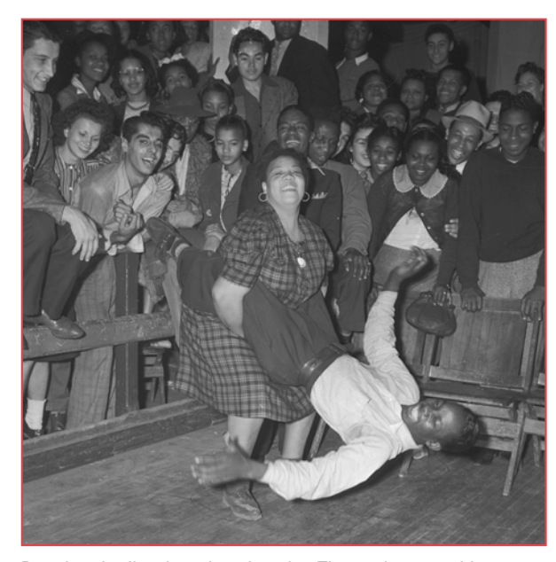
Dancing the jitterbug; Los Angeles Times photographic archive, UCLA Library.