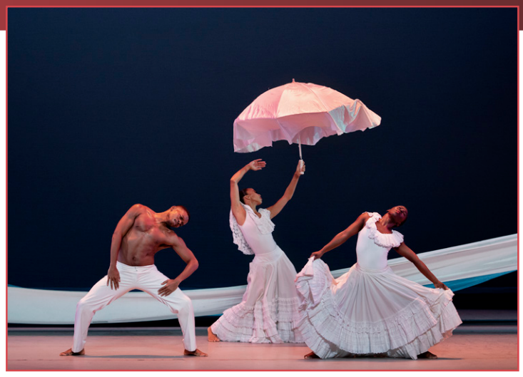
AAADT in Alvin Ailey's Revelations.