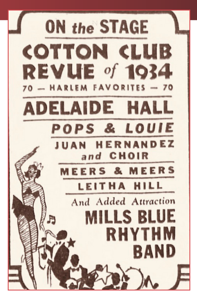
Adelaide Hall starring in the Cotton Club Revue of 1934 at the Loew's Metropolitan Theater, Brooklyn, commencing on 7 September 1934 (advertisement). 10 July 2019, The Brooklyn Daily Eagle , 6 September 1934,

The Harlem Renaissance of the 1920s saw an explosion of African American literature, music, theater, and dance. In jazz venues like the Cotton Club and Savoy Ballroom, Black dancers showcased new styles of couples dancing like the Charleston, Lindy Hop, and Jitterbug.