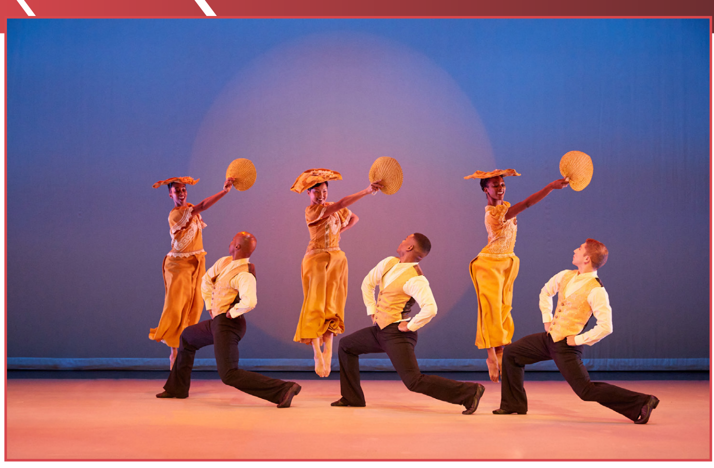
AAADT in Alvin Ailey's Revelations .